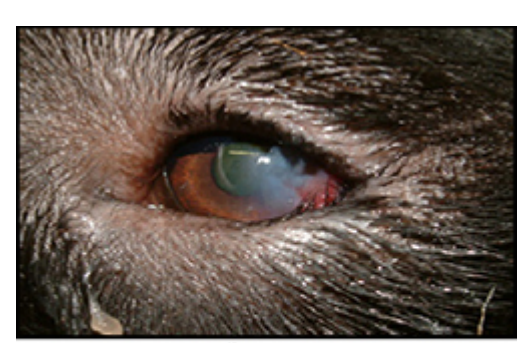
Entropion affecting the lower lid, which has caused a corneal ulcer.

The treatment for entropion is surgical correction. A section of skin is removed from the affected eyelid to reverse its inward rolling. In many cases, a primary, major surgical correction will be performed, and will be followed by a second, minor corrective surgery later. Two surgeries are often performed to reduce the risk of over-correcting the entropion, resulting in an outward-rolling eyelid known as ectropion . Most dogs will not undergo surgery until they have reached their adult size at six to twelve months of age.